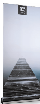
Premium Pull Up