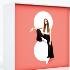
Backlit Fabric Counter