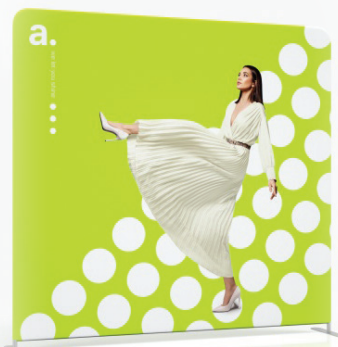
Fabric Display Wall